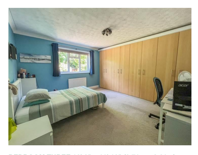
BEDROOM THREE 12' 2" x 11' 10" (3.71m x 3.61m)

Double glazed window to rear aspect. Coving to ceiling. Radiator. Fitted wardrobes to one wall.