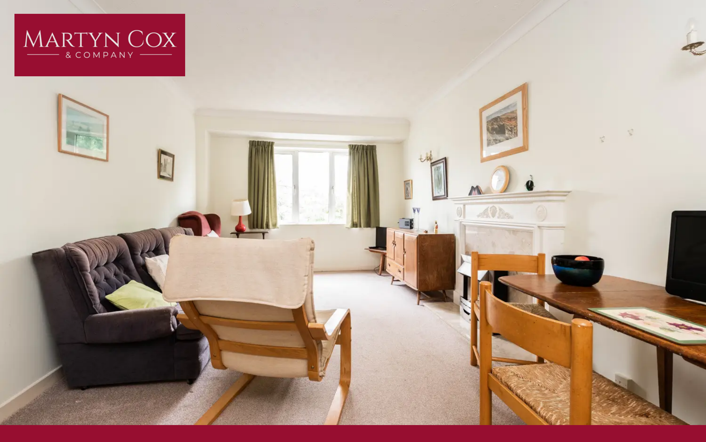
Flat 46, Windrush Court, 67 St. Marys Mead - OX28 4FD Witney