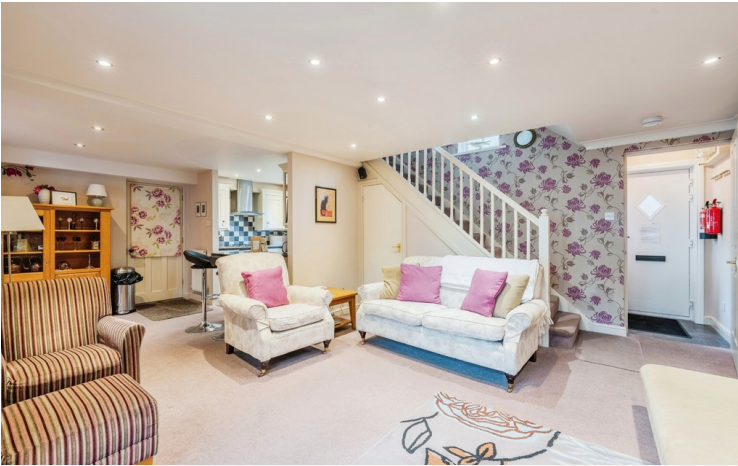
Open Plan Kitchen/Living Room