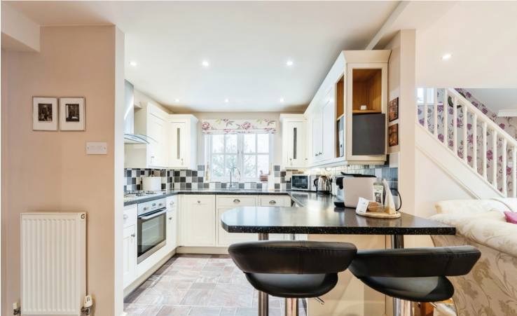
Open Plan Kitchen/Living Room