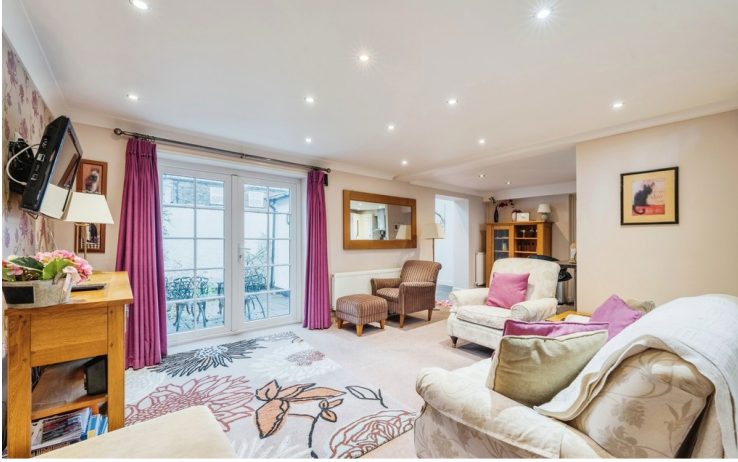
Open Plan Kitchen/Living Room