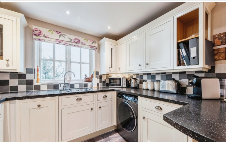
Open Plan Kitchen/Living Room