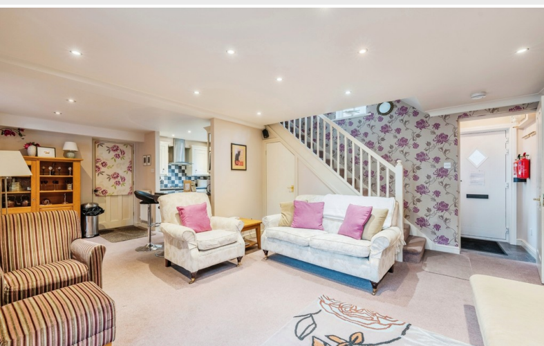
Open Plan Kitchen/Living Room