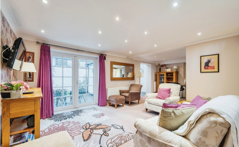
Open Plan Kitchen/Living Room