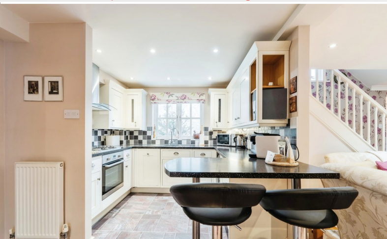
Open Plan Kitchen/Living Room