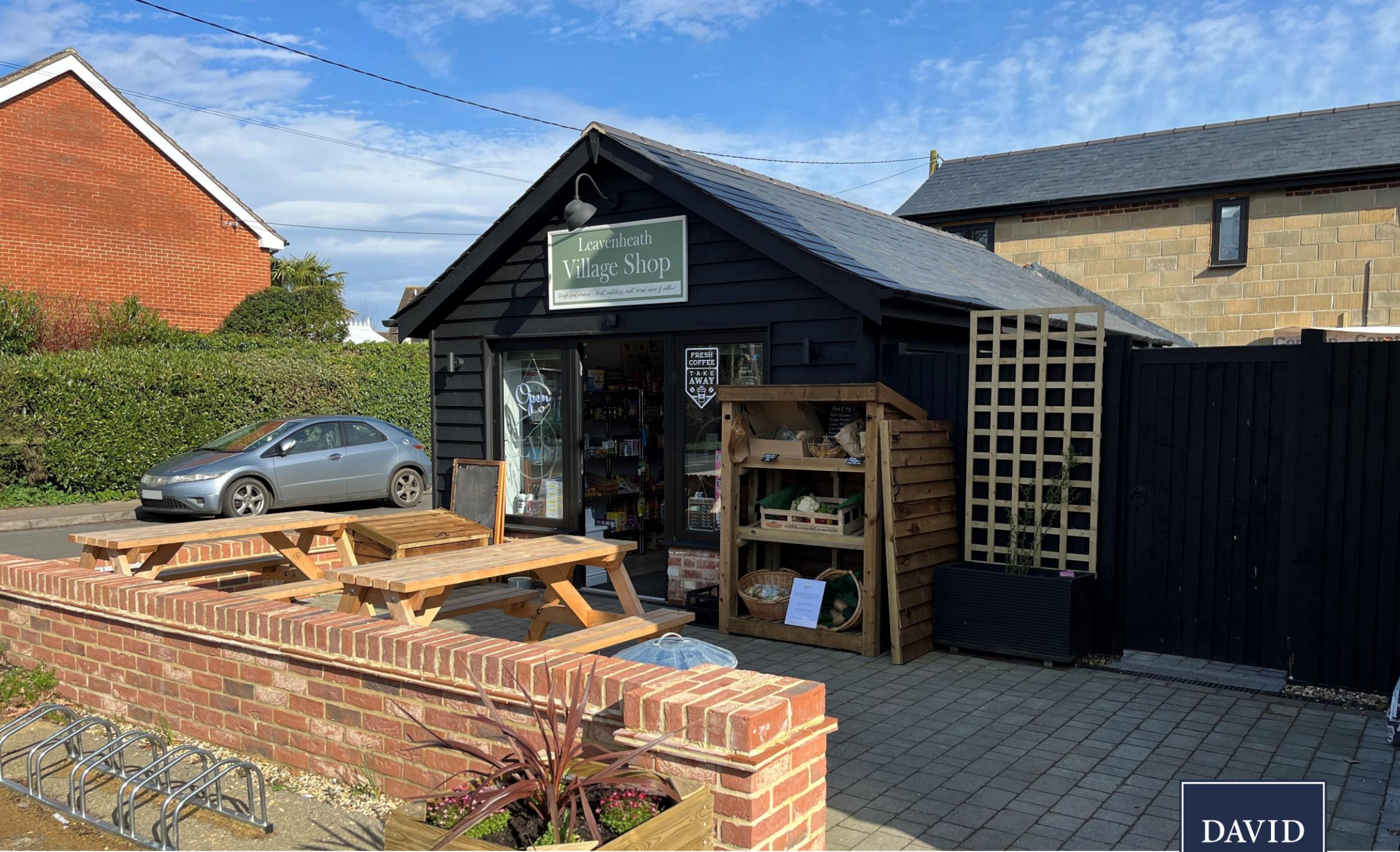
Leavenheath Village Shop Leavenheath, Suffolk