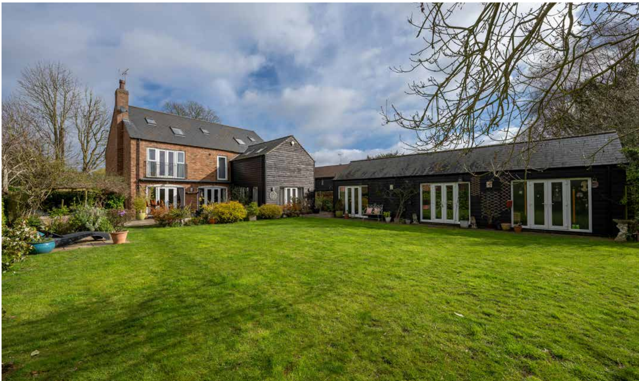
The Smithy Tydd St Giles | Wisbech | PE13 5LF