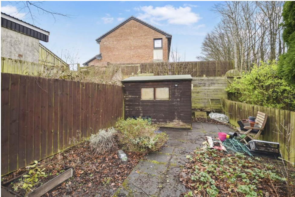
Next Home - 109 Crieff Road, Perth, PH1 2PB