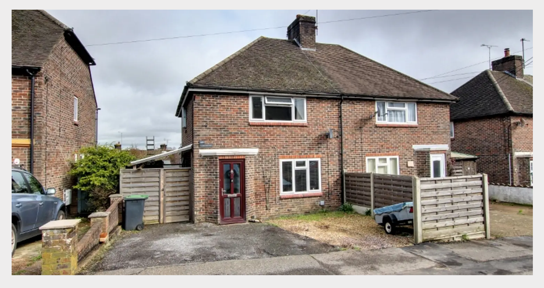
69 Bentswood Crescent, Haywards Heath, West Sussex RH16 3QP

GUIDE PRICE ... £375,000-£385,000 ... FREEHOLD