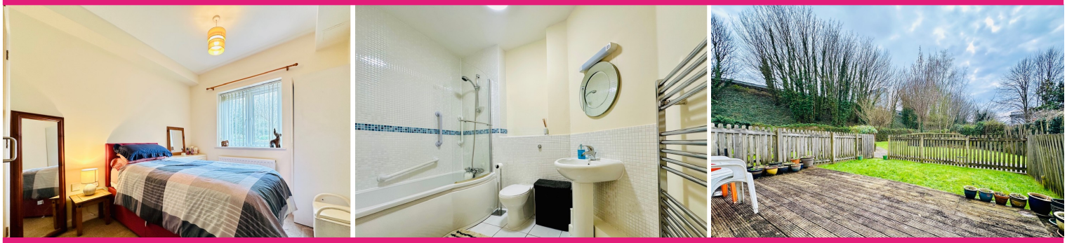
GROUND FLOOR 449 sq.ft. (41.7 sq.m.) approx.