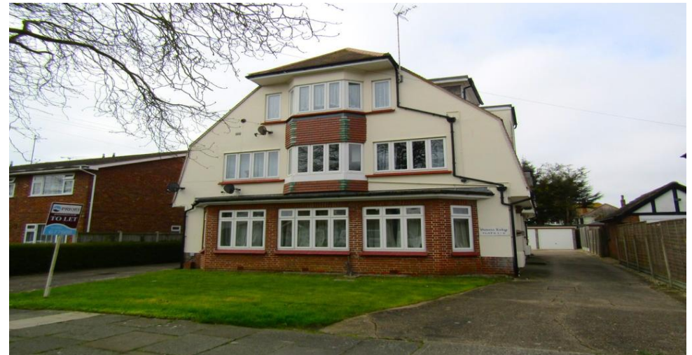
Victoria Road Clacton-on-Sea

Agents Note: Whilst every care has been taken to prepare these particulars, they are for guidance purposes only. All measurements are approximate, are for general guidance purposes only and whilst every care has been taken to ensure their accuracy they should not be relied upon and potential tenants are advised to recheck the measurements.