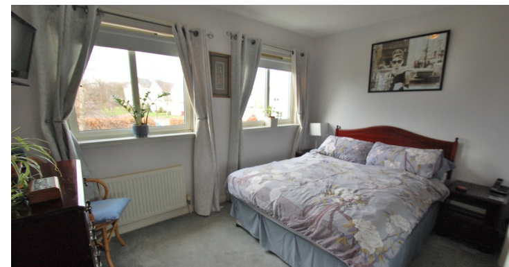
14 Carriden Place