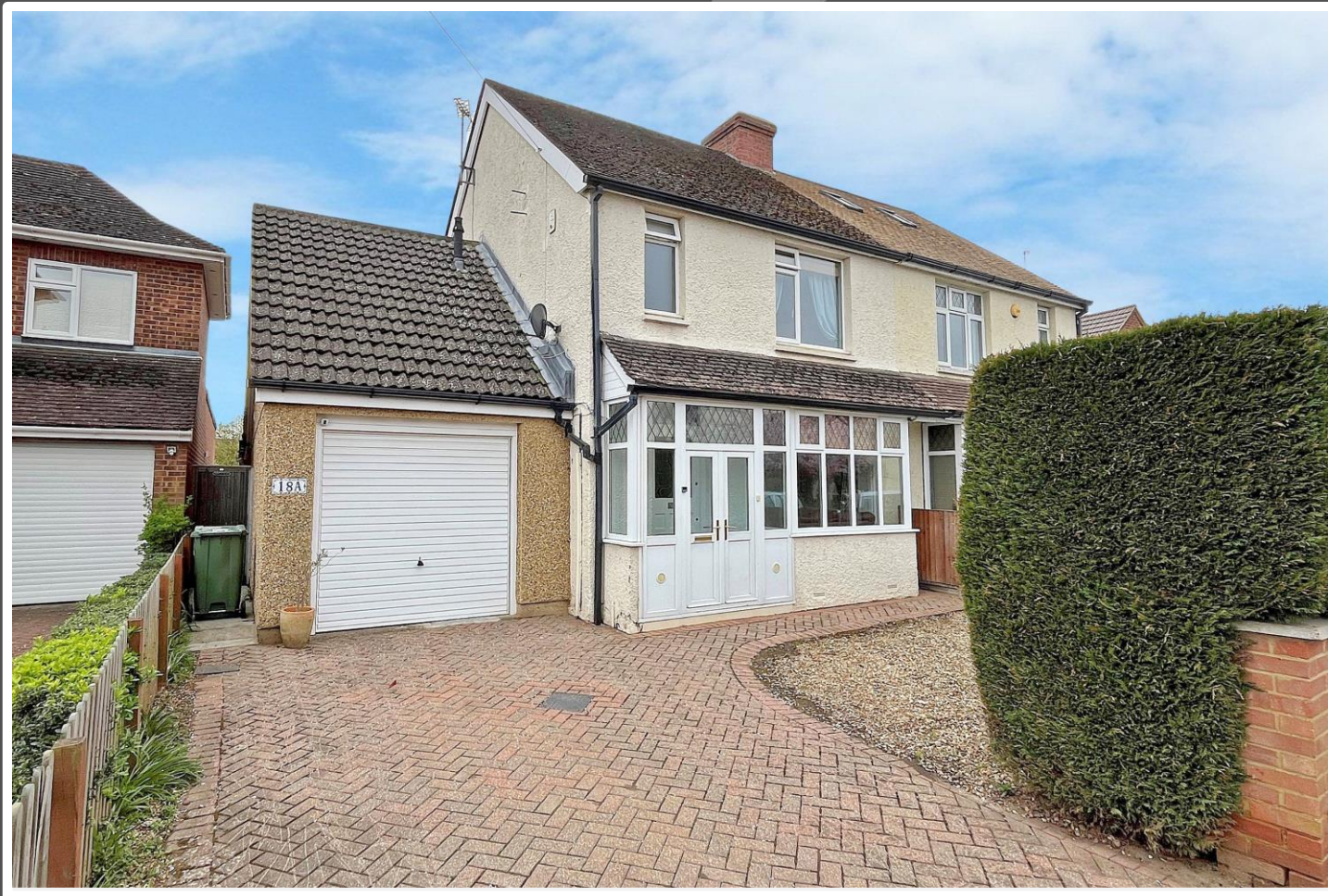
Kings Road, Flitwick, Bedfordshire MK45 1ED