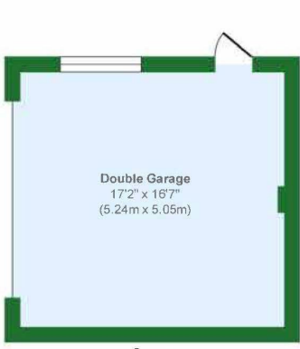
Garage Approximate Area 110 sq. ft (10.29 sq. m)