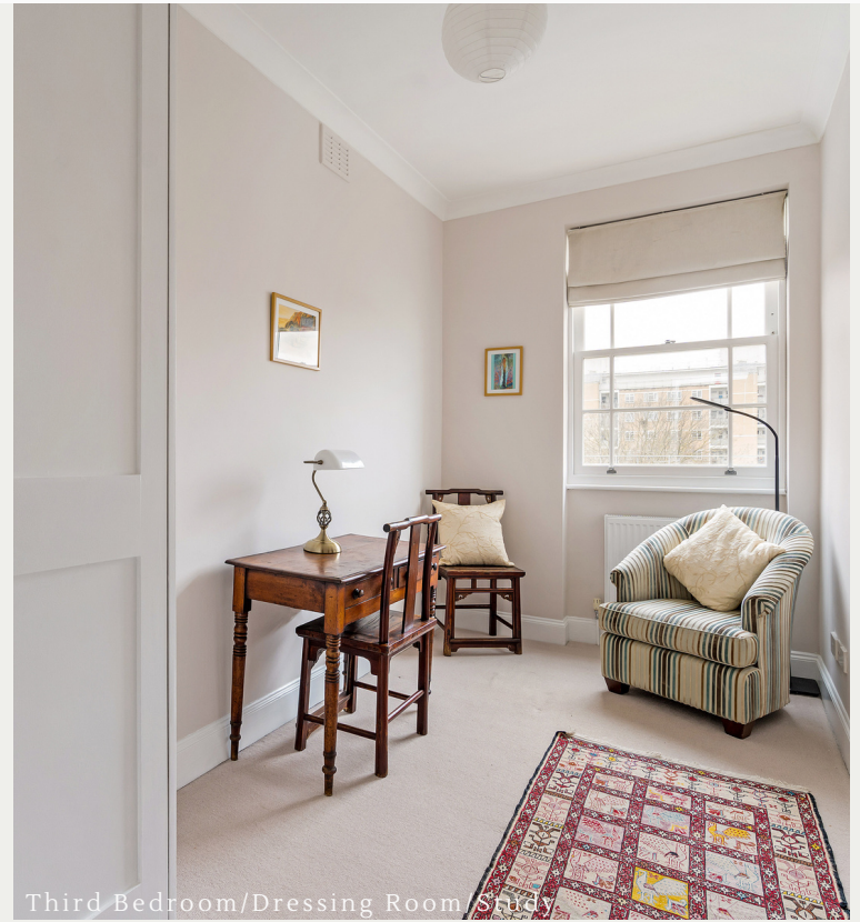
Third Bedroom/Dressing Room/Study