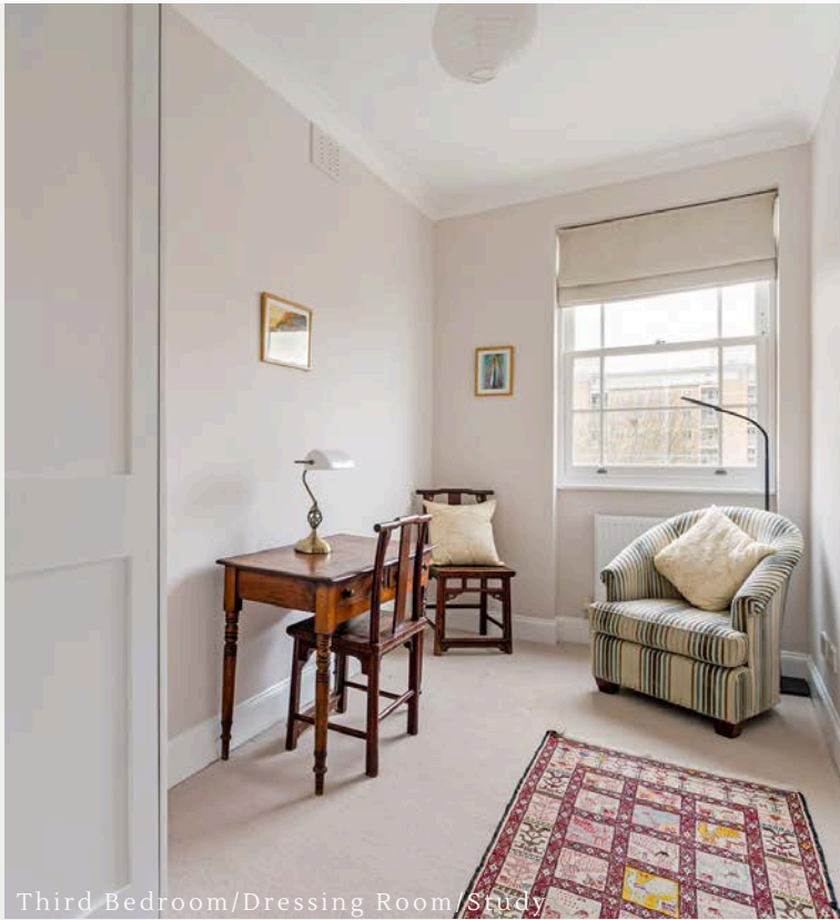
Third Bedroom/Dressing Room/Study