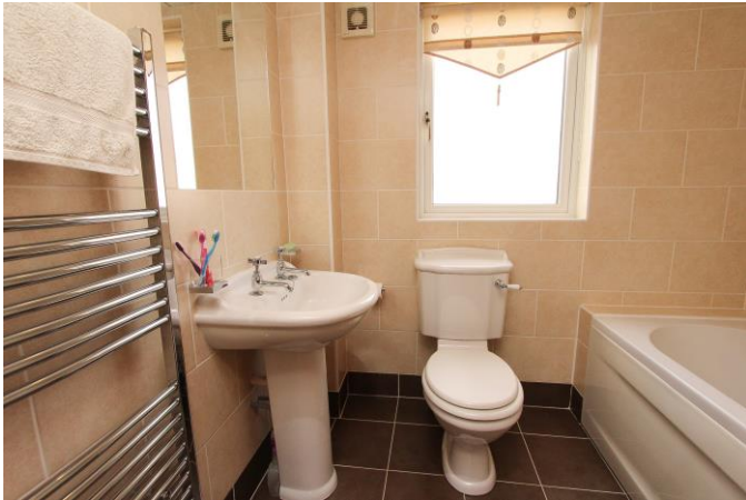
BATHROOM: The bathroom is fitted with a 3 – piece suite in white comprising a WHB, WC and bath. There is a mains shower in place over the bath. Heated towel rail.