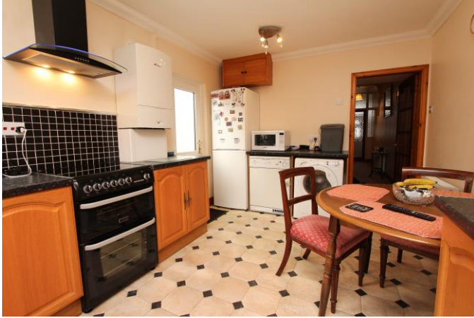
Further Kitchen image