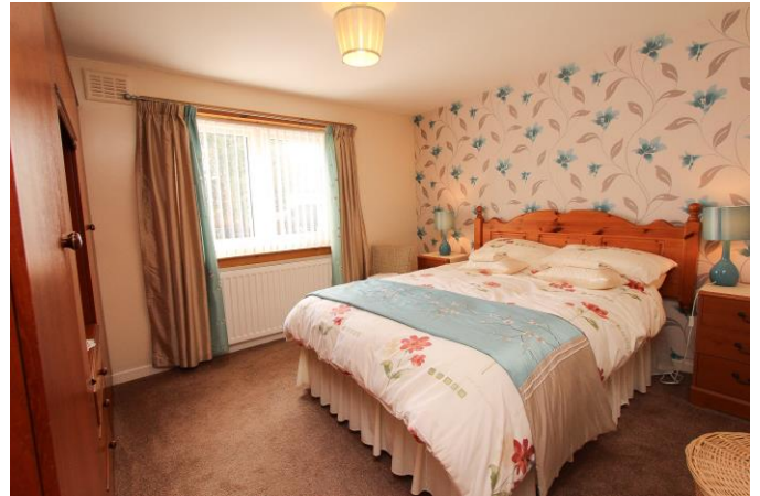
BEDROOM 1: A bedroom to the rear with CH radiator.