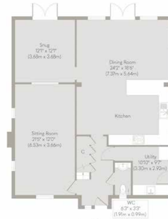
Ground Floor Approximate Floor Area 1054 sq. ft. (97.90 sq. m)

Whilst every attempt has been made to ensure the accuracy of the floor plan contained here, measurements of doors, windows, rooms and any other items are approximate and no responsibility is taken for any error, omission, or mis-statement. This plan is for illustrative purposes only and should be used as such by any prospective purchaser or tenant. The services, systems and appliances shown have not been tested and no guarantee as to their operability or efficiency can be given.