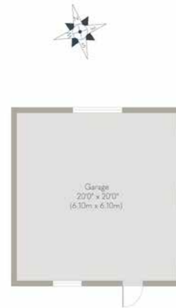
Garage Approximate Floor Area 400 sq. ft. (37.16 sq. m)