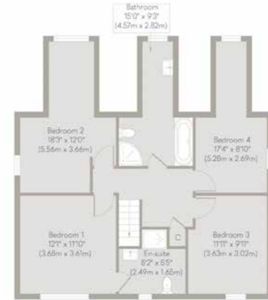
First Floor Approximate Floor Area 777 sq. ft. (72.22 sq. m)