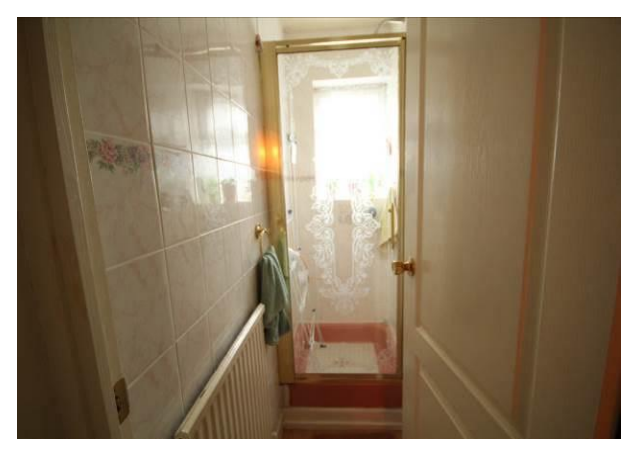
BEDROOM 1: 12' \times 9' 6" (3.66m \times 2.9m) Radiator and double glazed window. Shower cubicle separate with double glazed window and radiator.