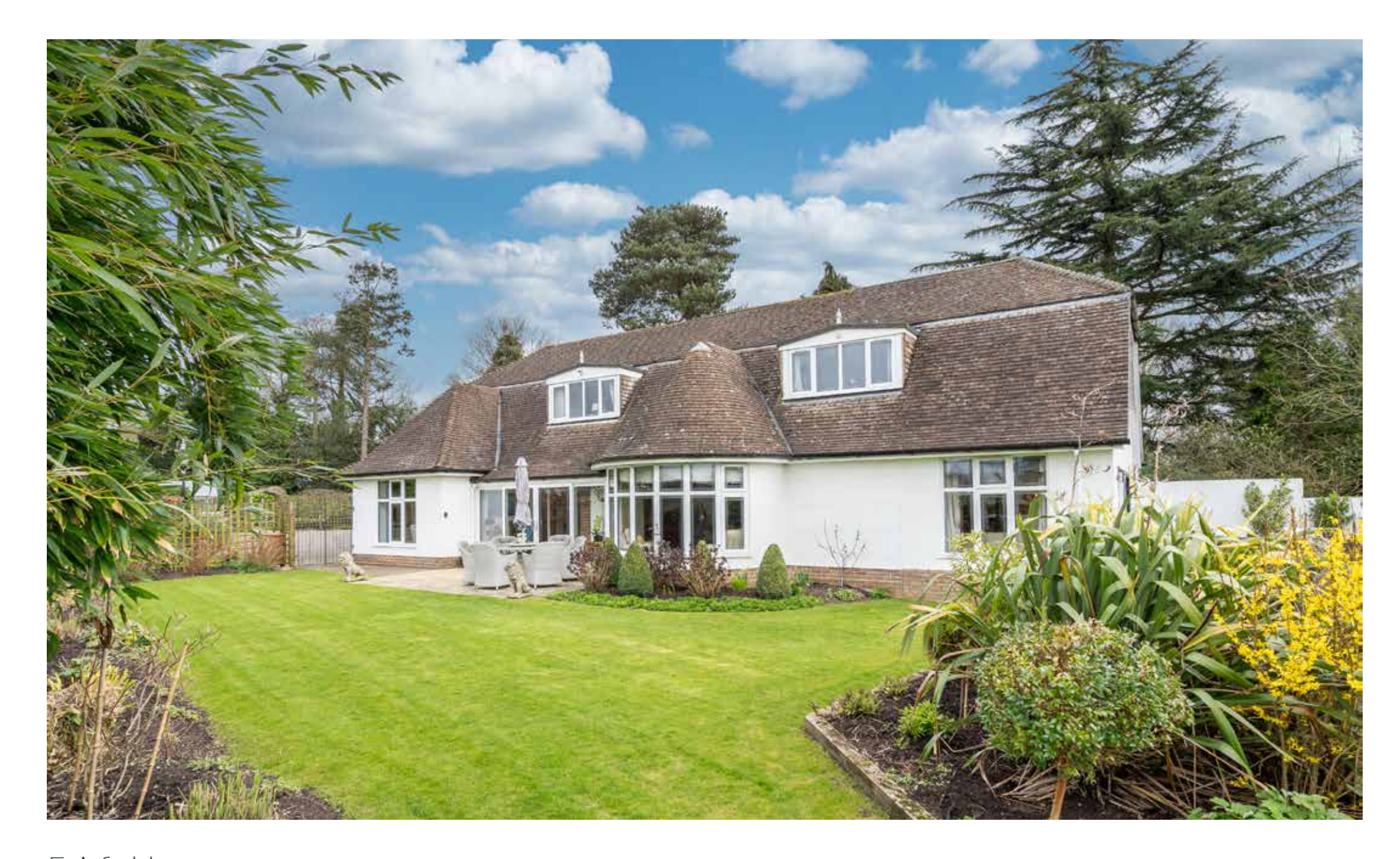
Fairfield Station Lane | Hethersett | Norfolk | NR9 3AX