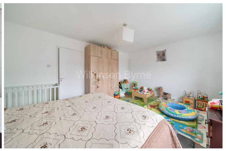
These particulars, whilst believed to be accurate set out as a general outline only for guidance and do not constitute any part of an offer or contract. Intending purchasers should not rely on them as fittings. Room sizes should not be relied upon for carpets and furnishings. The measurements given are approximate. No person in this firm's employment has the authority to make or give any representation or warranty in respect of the property.