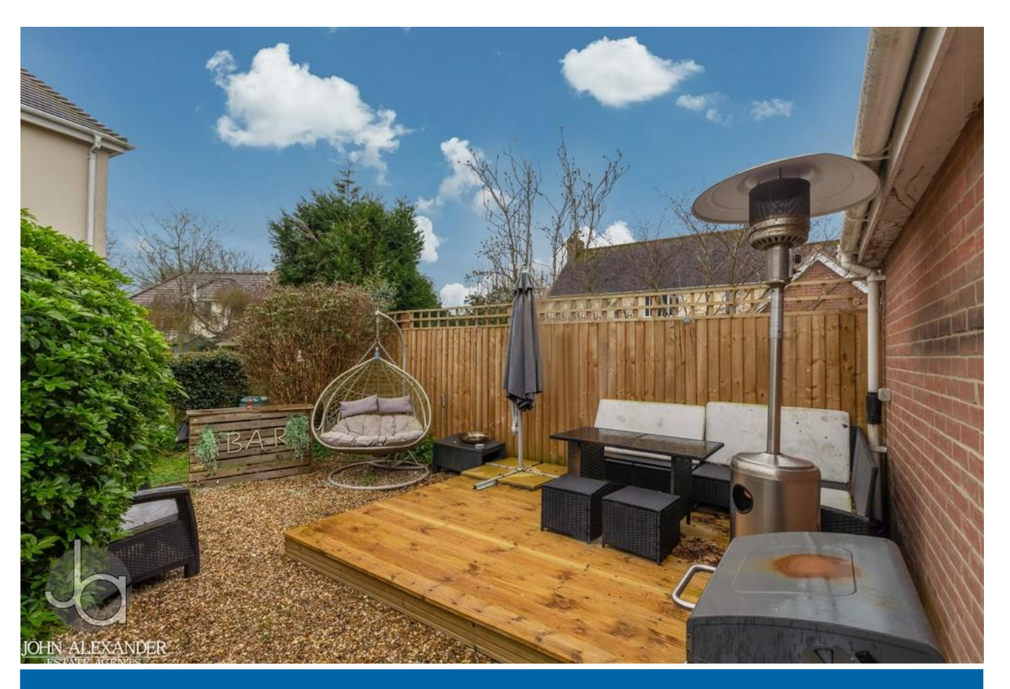
Mill Close, Tiptree CO5 0LE