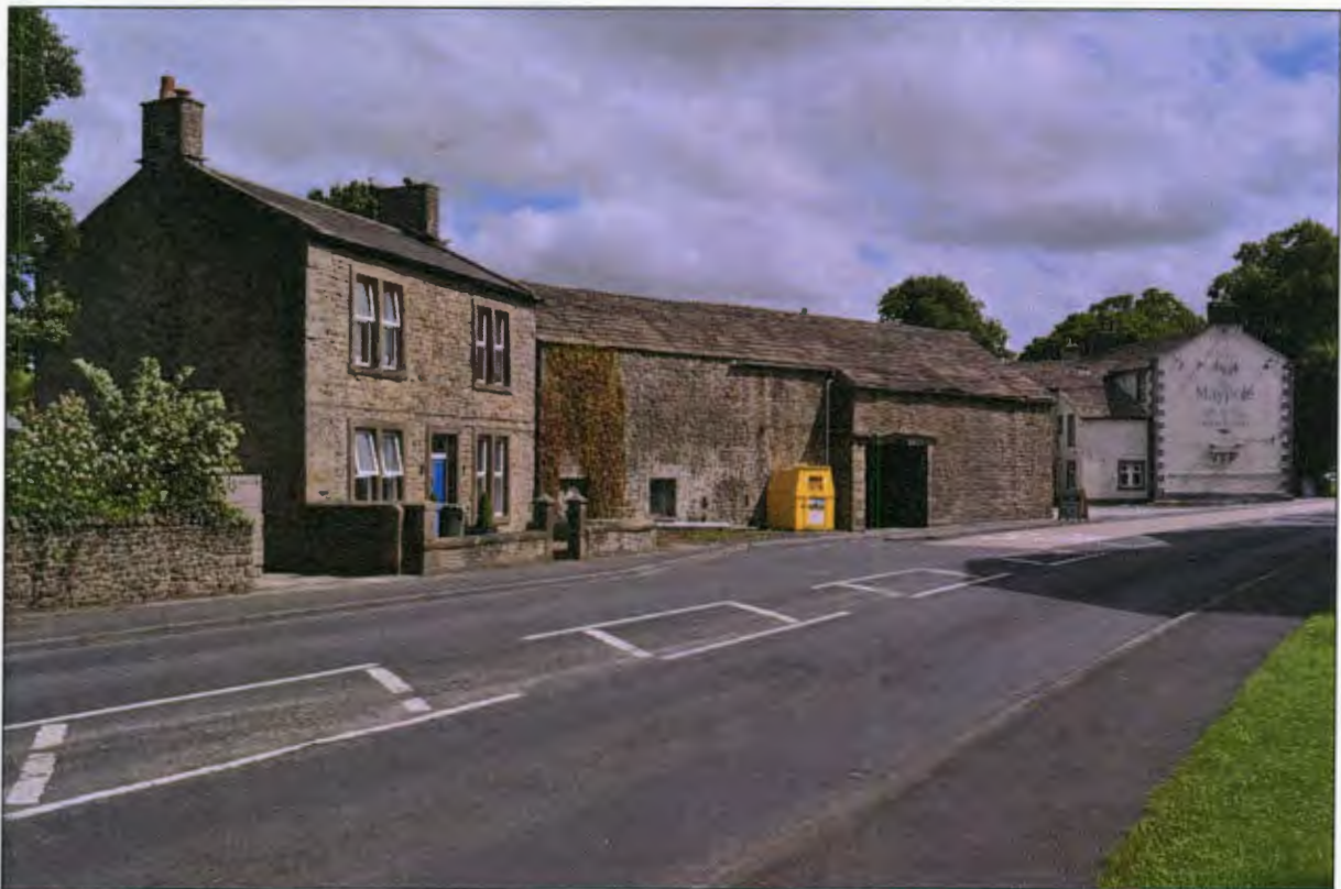
Photo 1: The barn, in its setting on Main Street between Rose-Lea (L) and Maypole Inn (R)