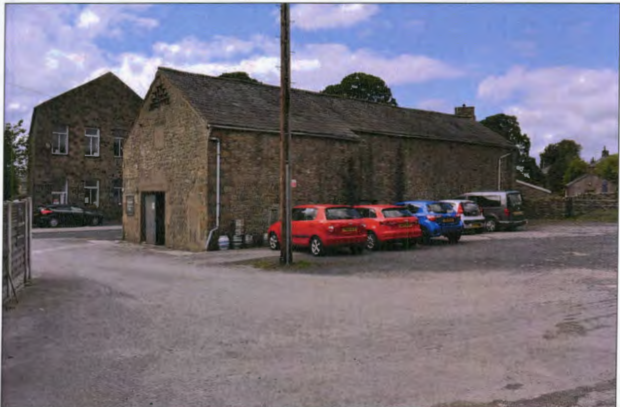
Photo 4: Rear of the barn, in its setting at the edge of Maypole Inn's car park