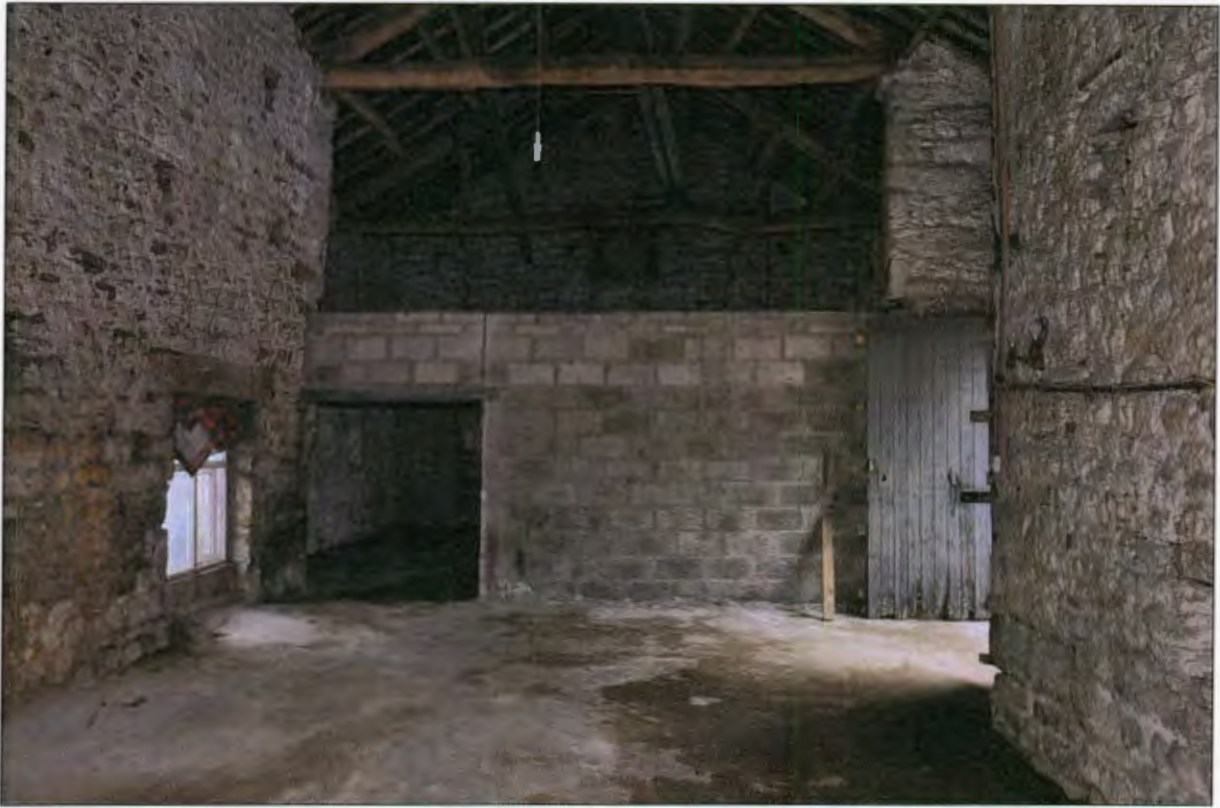
Photo 5: Interior, looking south-east: former threshing bay, with modern wall separating former shippon beyond