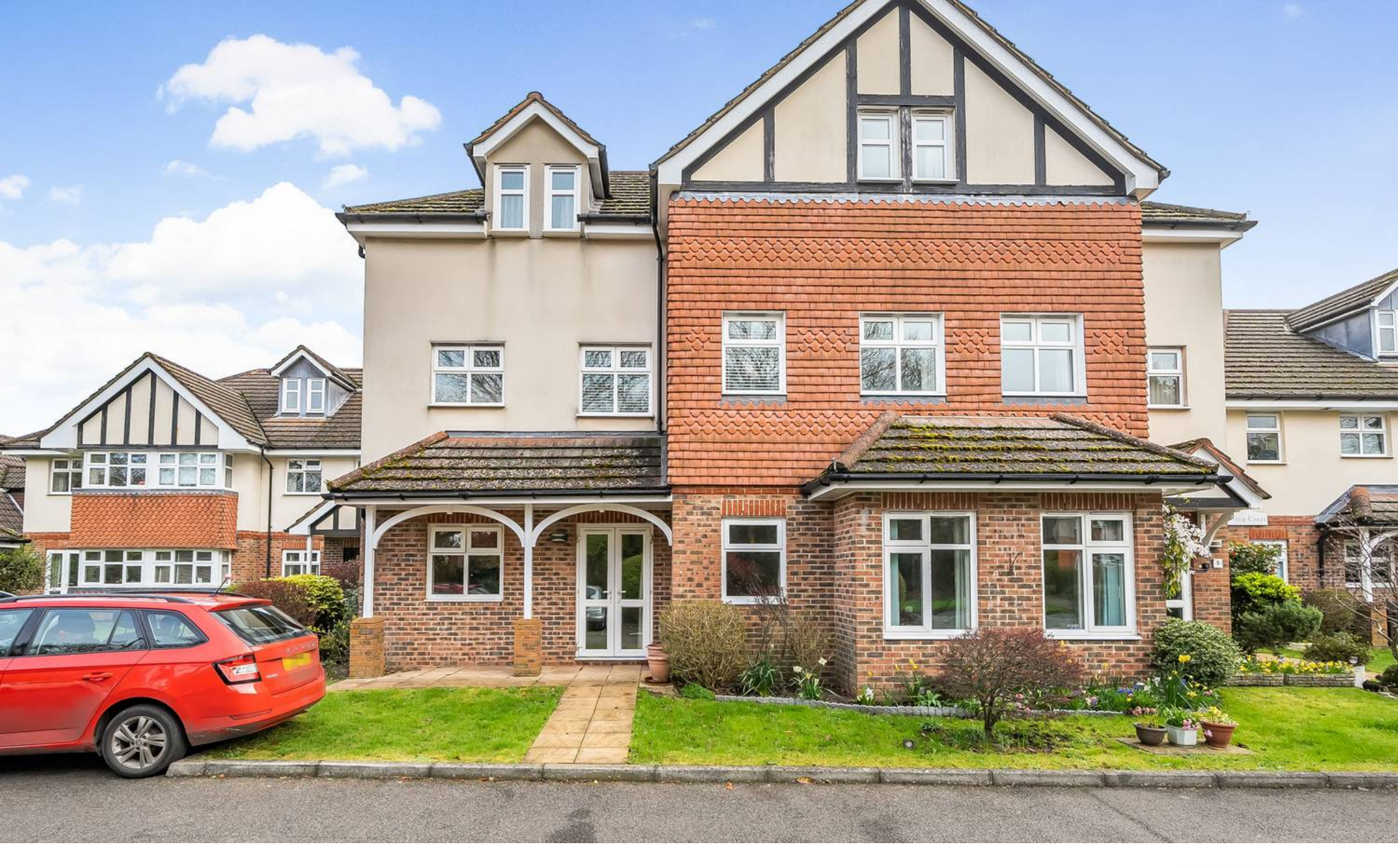
Flat 6, Wren Court, 303 Limpsfield Road - CR6 9RL Guide Price £270,000