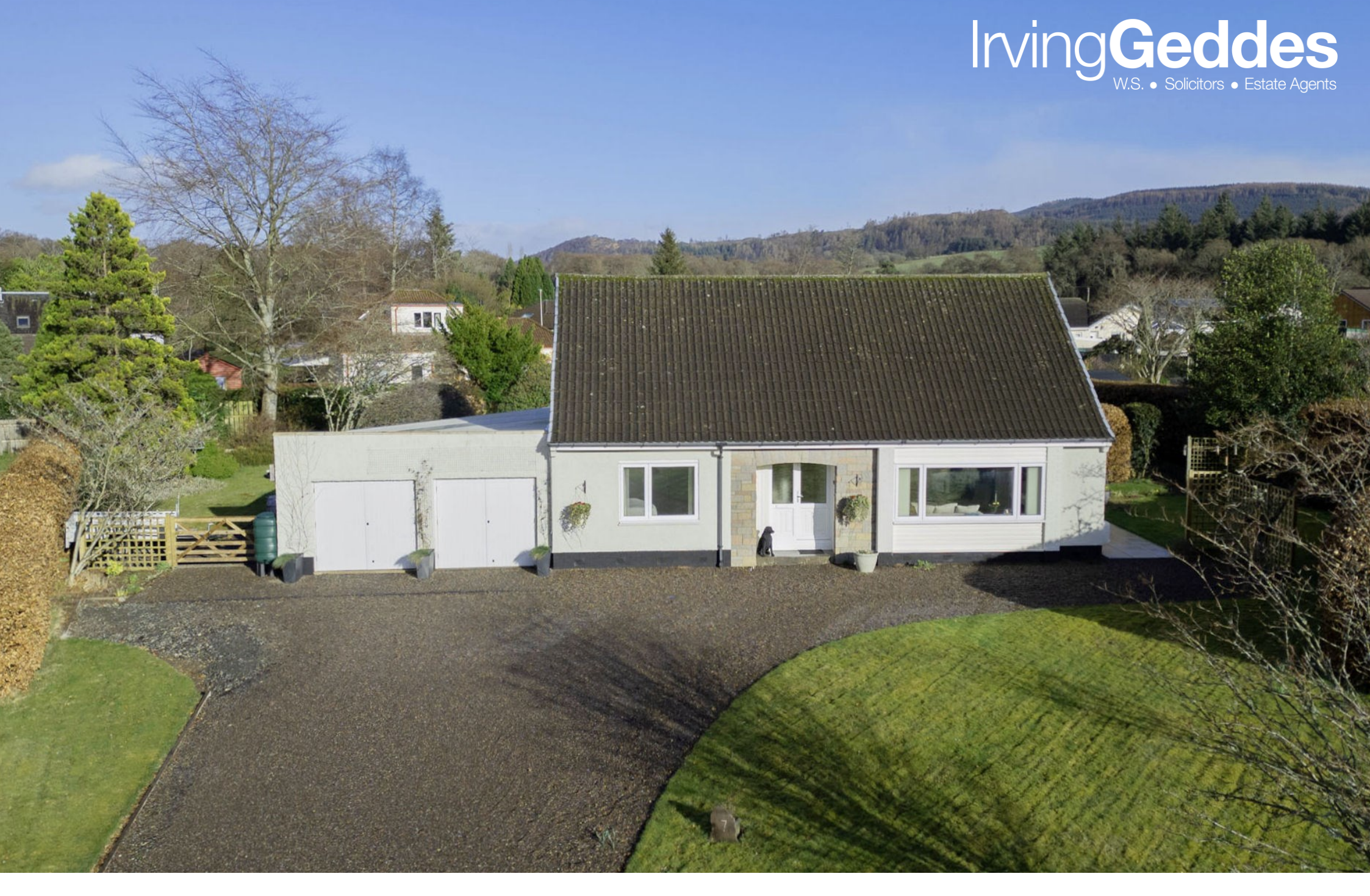
7 LENNOCH CIRCLE, COMRIE, PERTHSHIRE, PH6 2HS