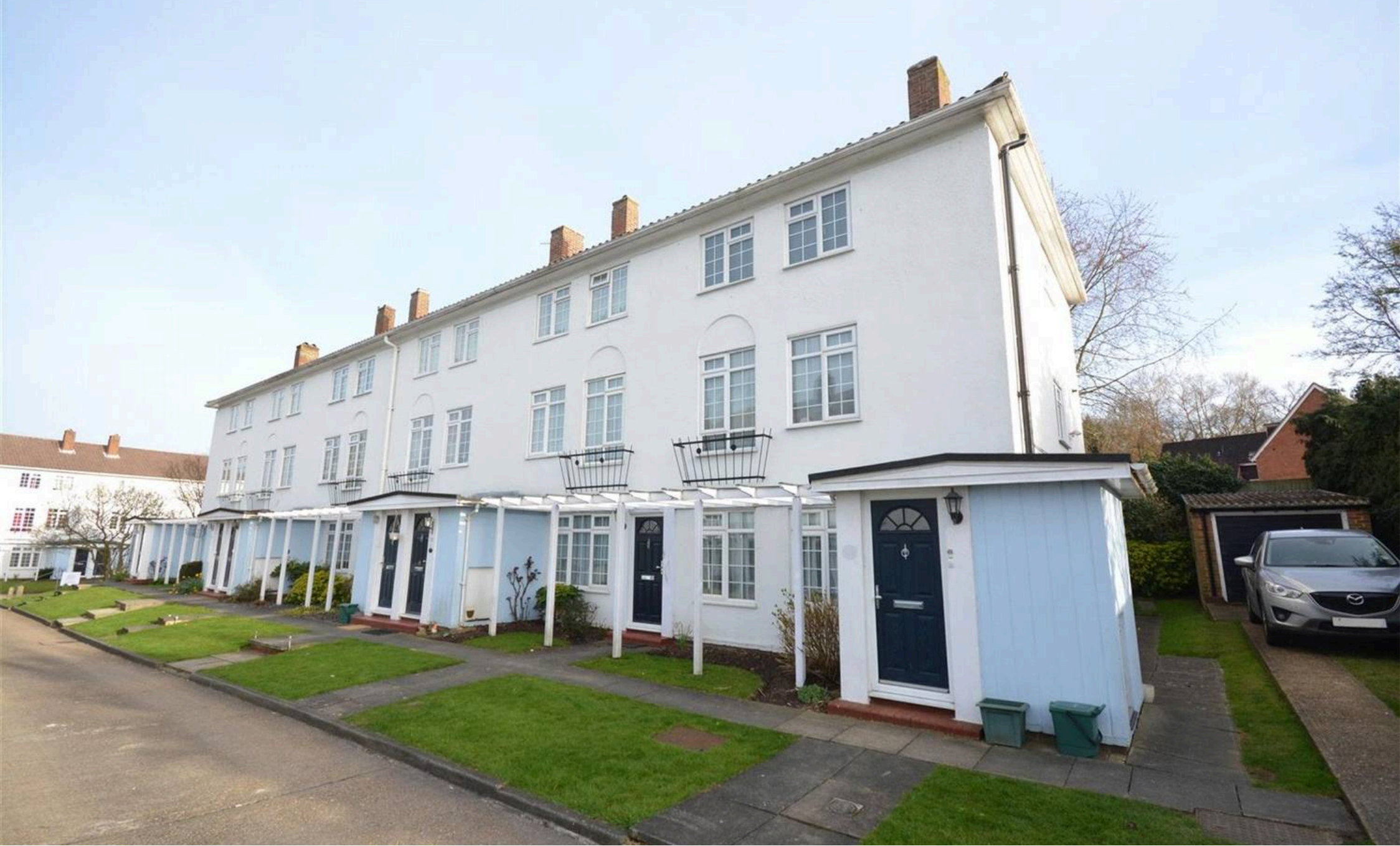
Manor House, Court West Street, Epsom