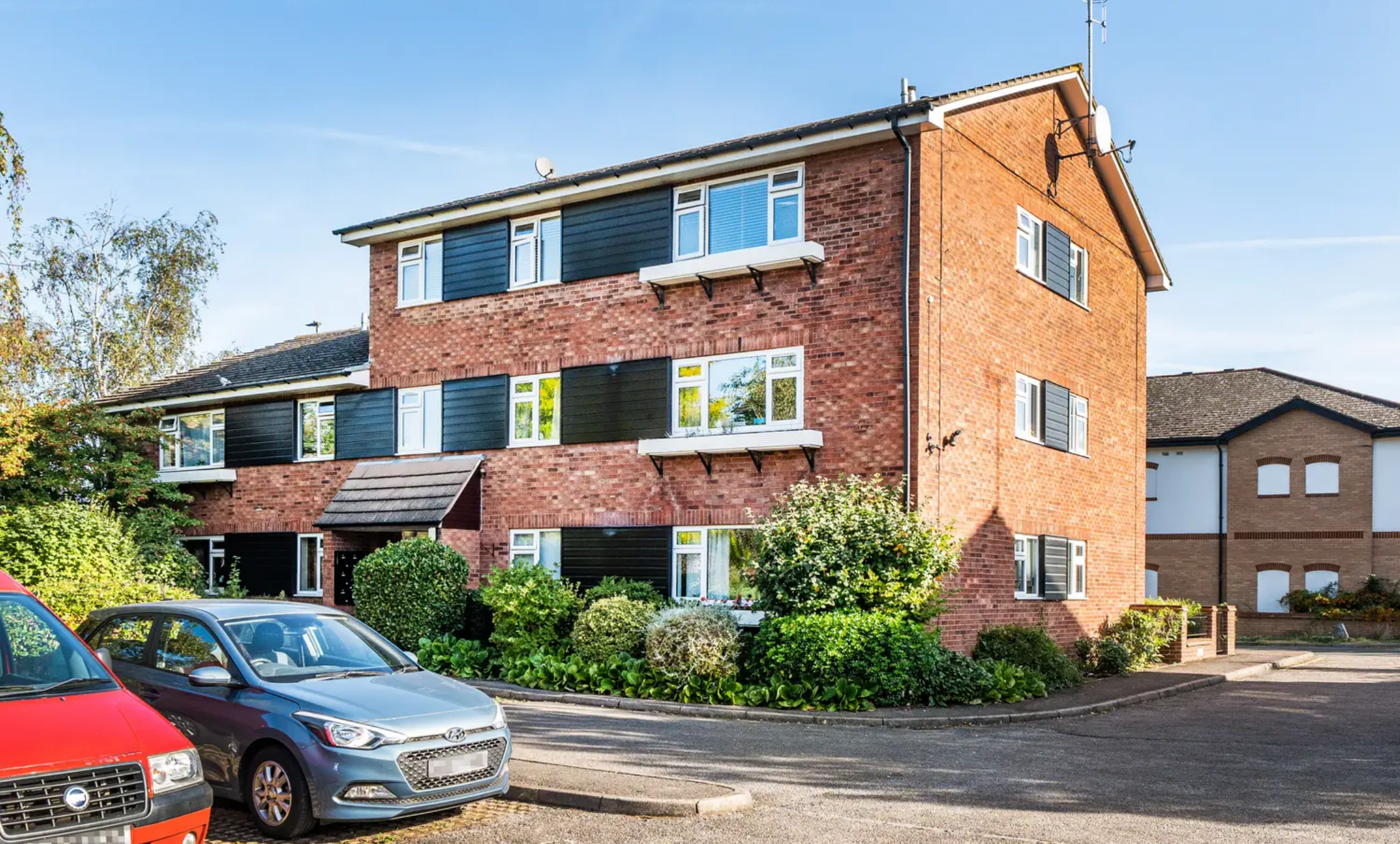
15 The Stanfords East Street, Epsom Epsom