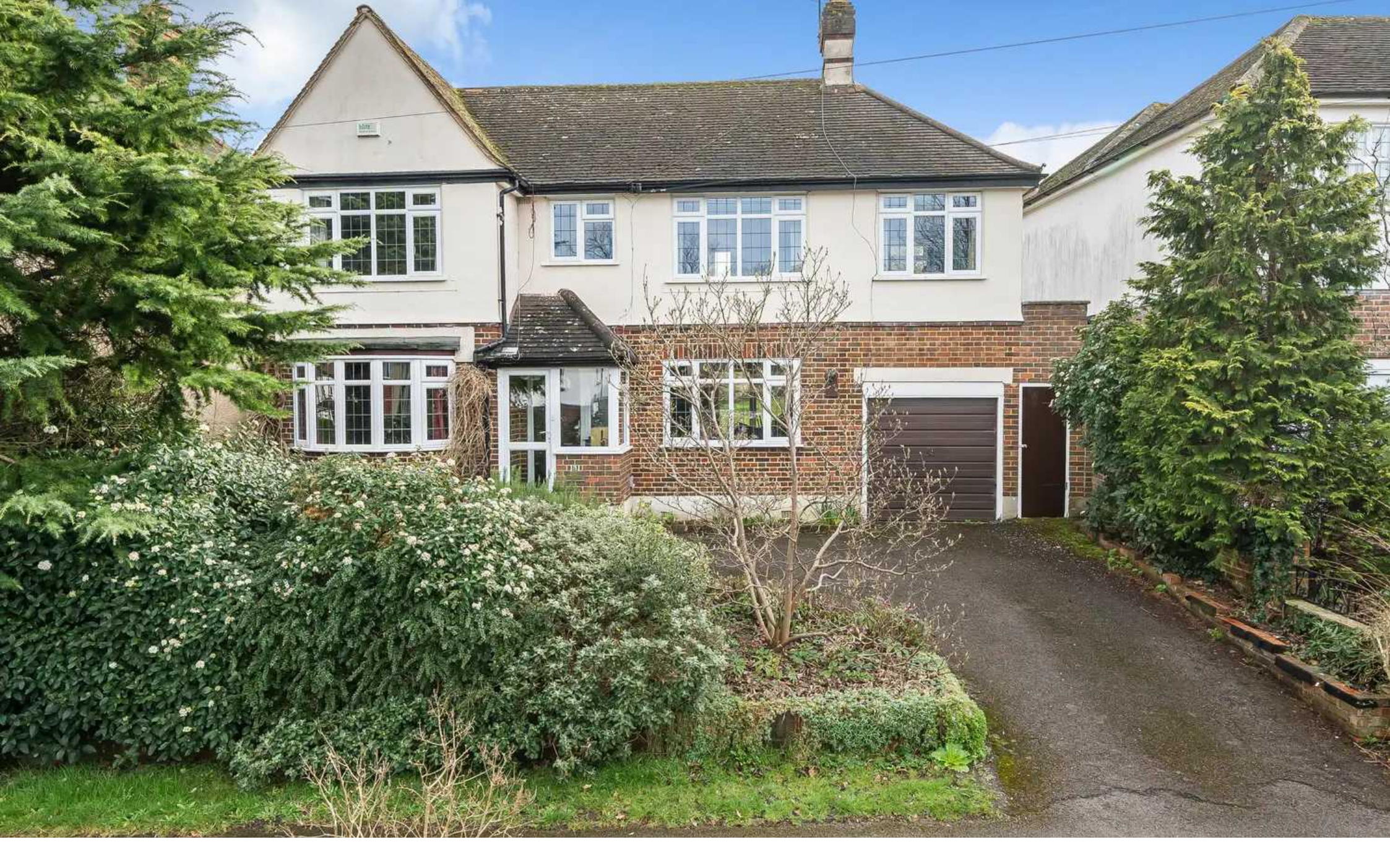
131 Manor Green Road, Epsom