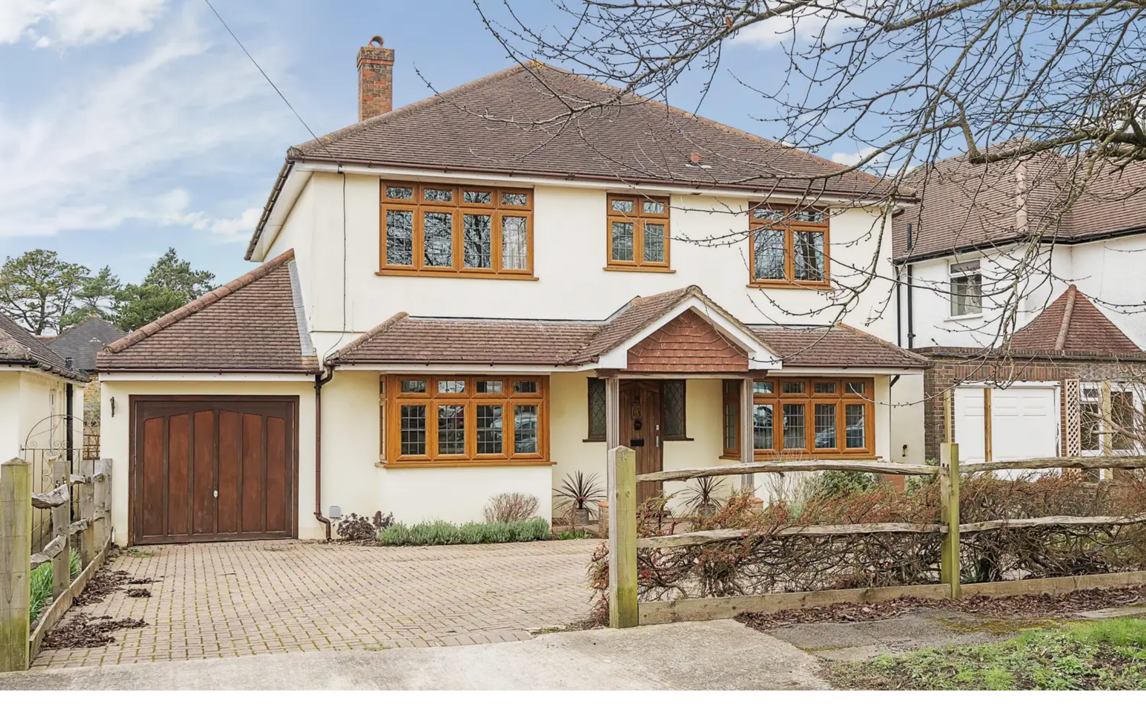
10 Claremount Gardens, Epsom