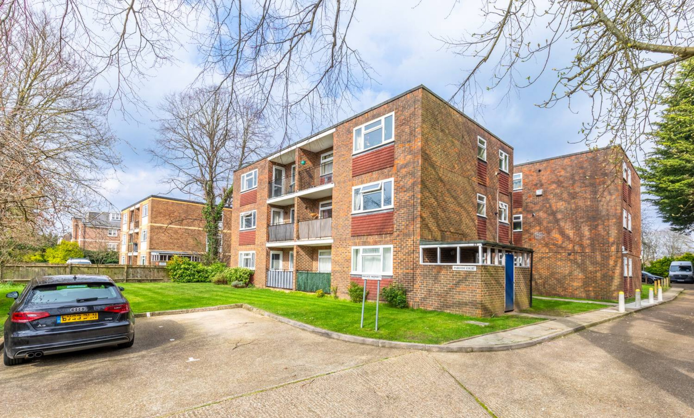
Flat 2, Parkside Court, 23 Alexandra Road Epsom