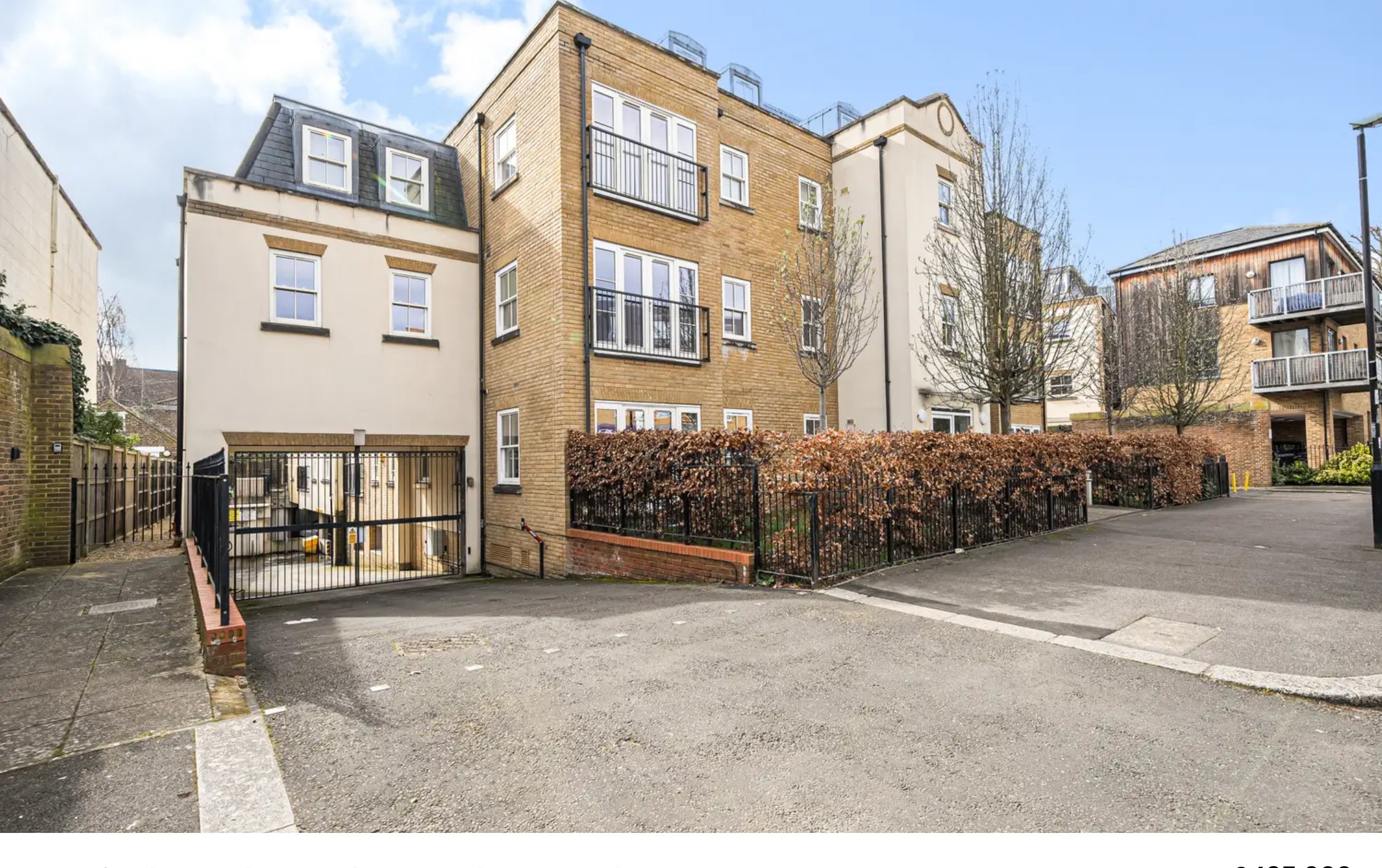
Flat 2, The Old Courthouse The Parade, Epsom