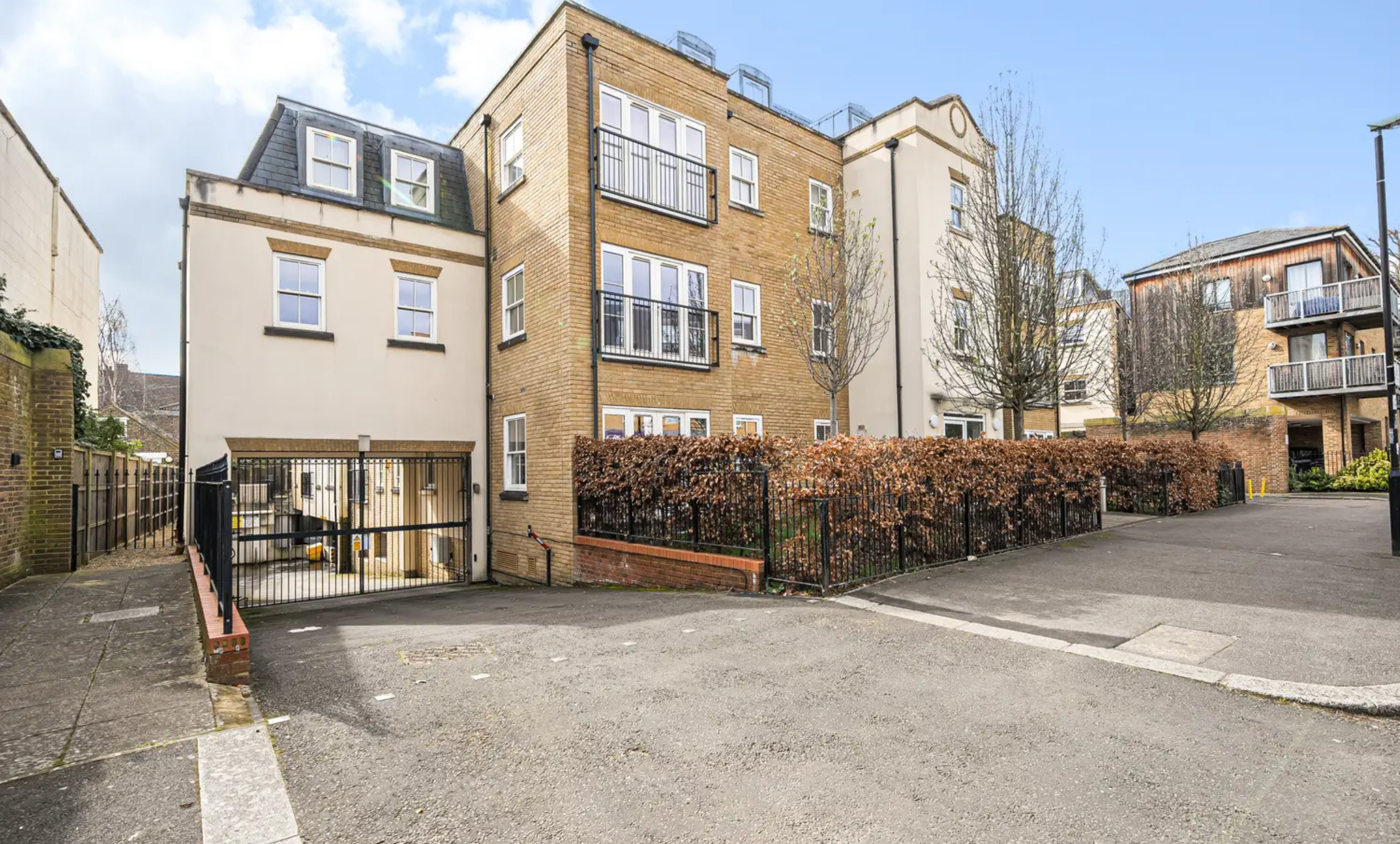
Flat 2, The Old Courthouse The Parade, Epsom Epsom