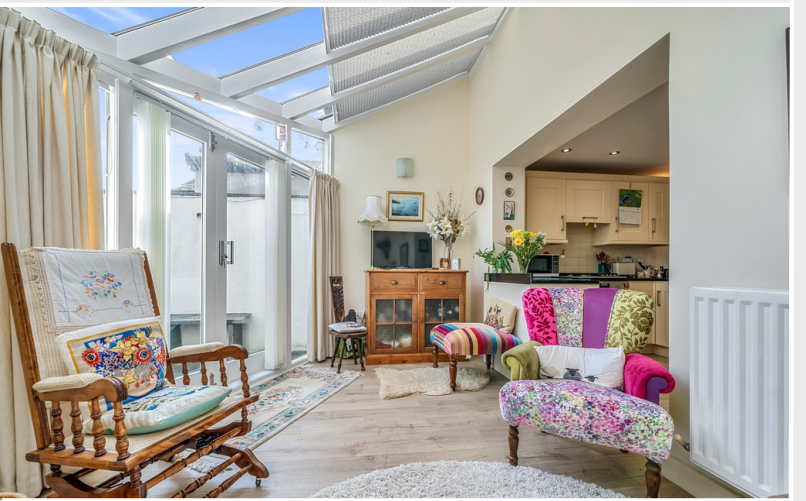
Open Plan Living Room / Dining Kitchen