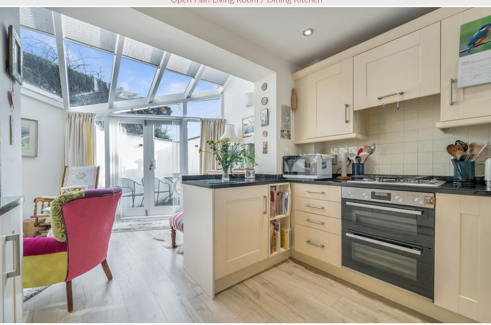
Open Plan Living Room / Dining Kitchen