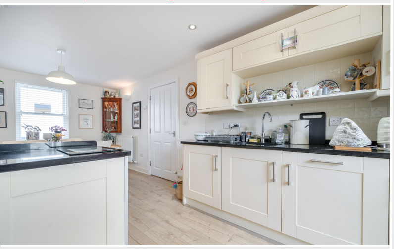
Open Plan Living Room / Dining Kitchen