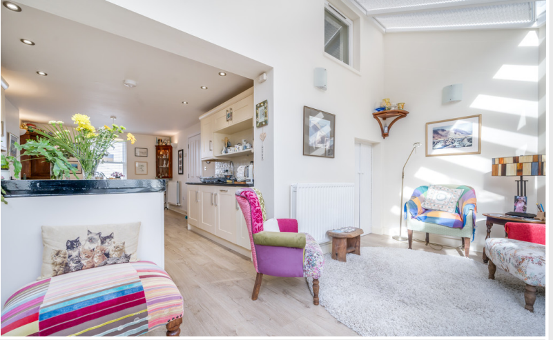
Open Plan Living Room / Dining Kitchen