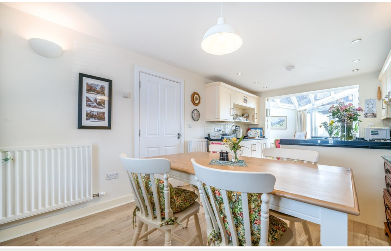
Open Plan Living Room / Dining Kitchen