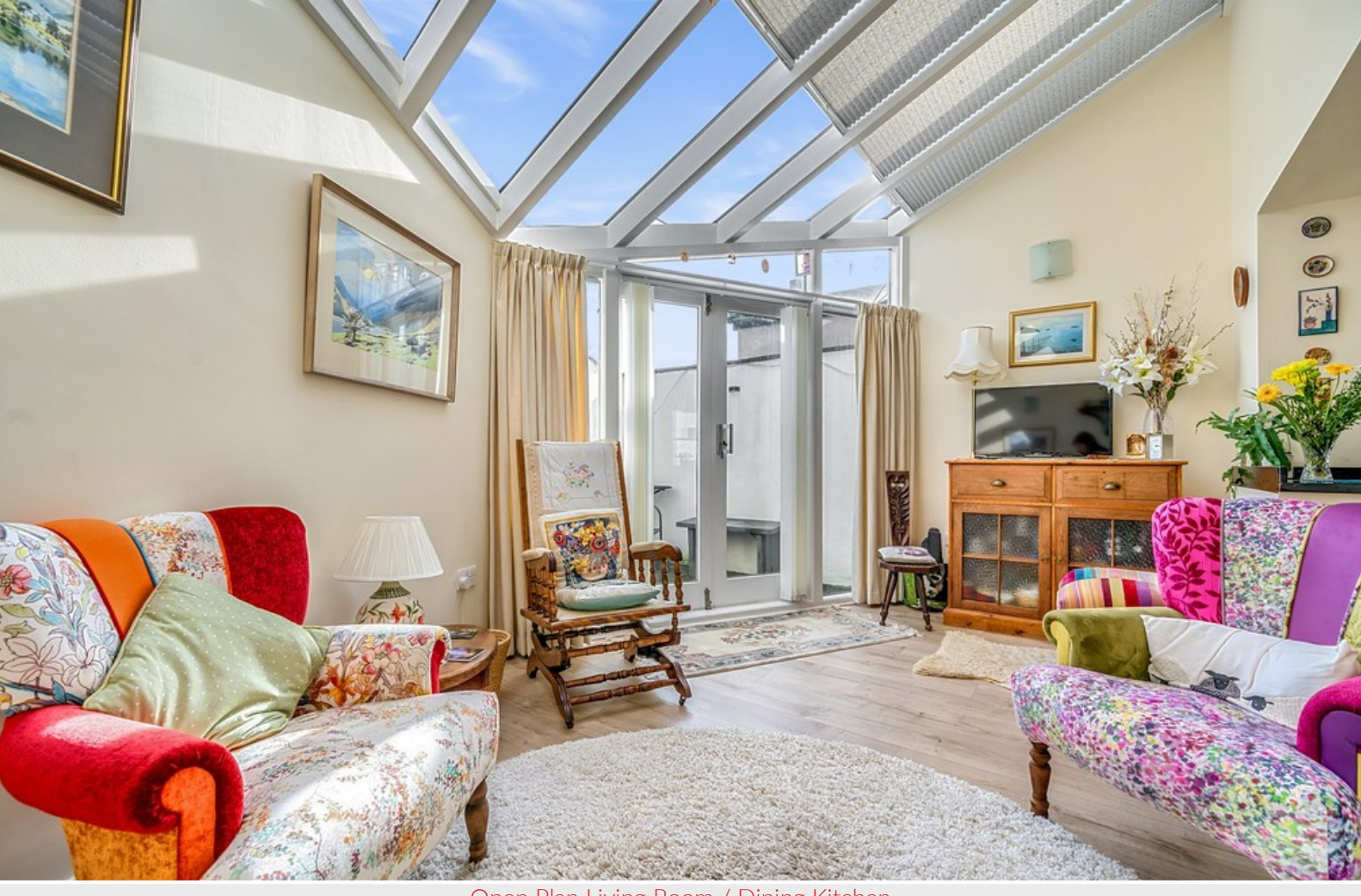
Open Plan Living Room / Dining Kitchen