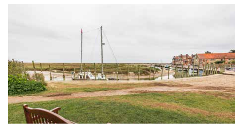
Looking out on to Blakeney Quay

"This property is located in the heart of Blakeney an Area of Outstanding Natural Beauty."