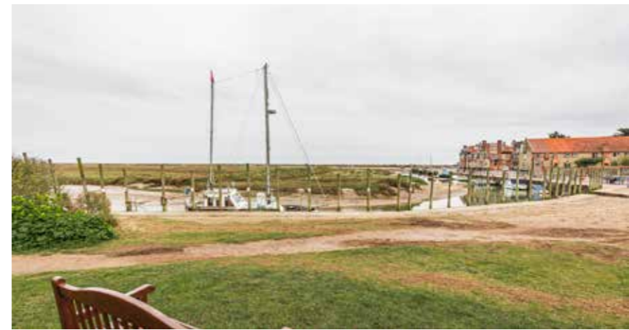
Looking out on to Blakeney Quay

“This property is located in the heart of Blakeney an Area of Outstanding Natural Beauty.”