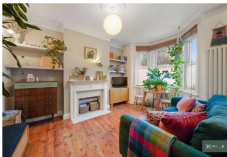
Hillside, London NW10 £399,999 Leasehold

Welcome to Hillside, where charm and modern comfort intertwine seamlessly in this inviting garden apartment nestled within a Victorian conversion. Situated on the ground floor, this residence boasts two generously sized bedrooms, ensuring ample space for relaxation and rest. Meticulously maintained, the property is presented in excellent condition throughout, promising a move-in ready experience. Upon arrival, a private entrance sets the tone for exclusivity and convenience. The low annual service charge further enhances the appeal, offering peace of mind to residents. Stepping inside, you're greeted by a reception room adorned with a charming feature fireplace, creating a cosy focal point for gatherings or quiet evenings in. The well-appointed kitchen, characterized by its modern design, leads seamlessly to a private section of the garden, providing an idyllic outdoor retreat for relaxation or entertaining. In addition to the masterful use of space, this apartment features two bathrooms, one of which is an en-suite, ensuring convenience and privacy for residents. Original Victorian features add character and timeless elegance to the property, enriching the living experience with a sense of history and heritage. In summary, this two-bedroom garden apartment at Hillside offers a harmonious blend of Victorian charm and contemporary convenience, promising a lifestyle of comfort and soph istication.