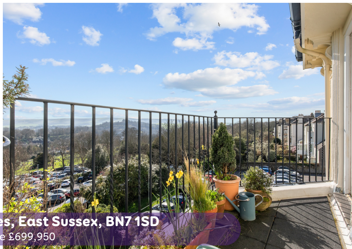
Southdown House, Lewes, East Sussex, BN7 1SD Asking Price £699,950