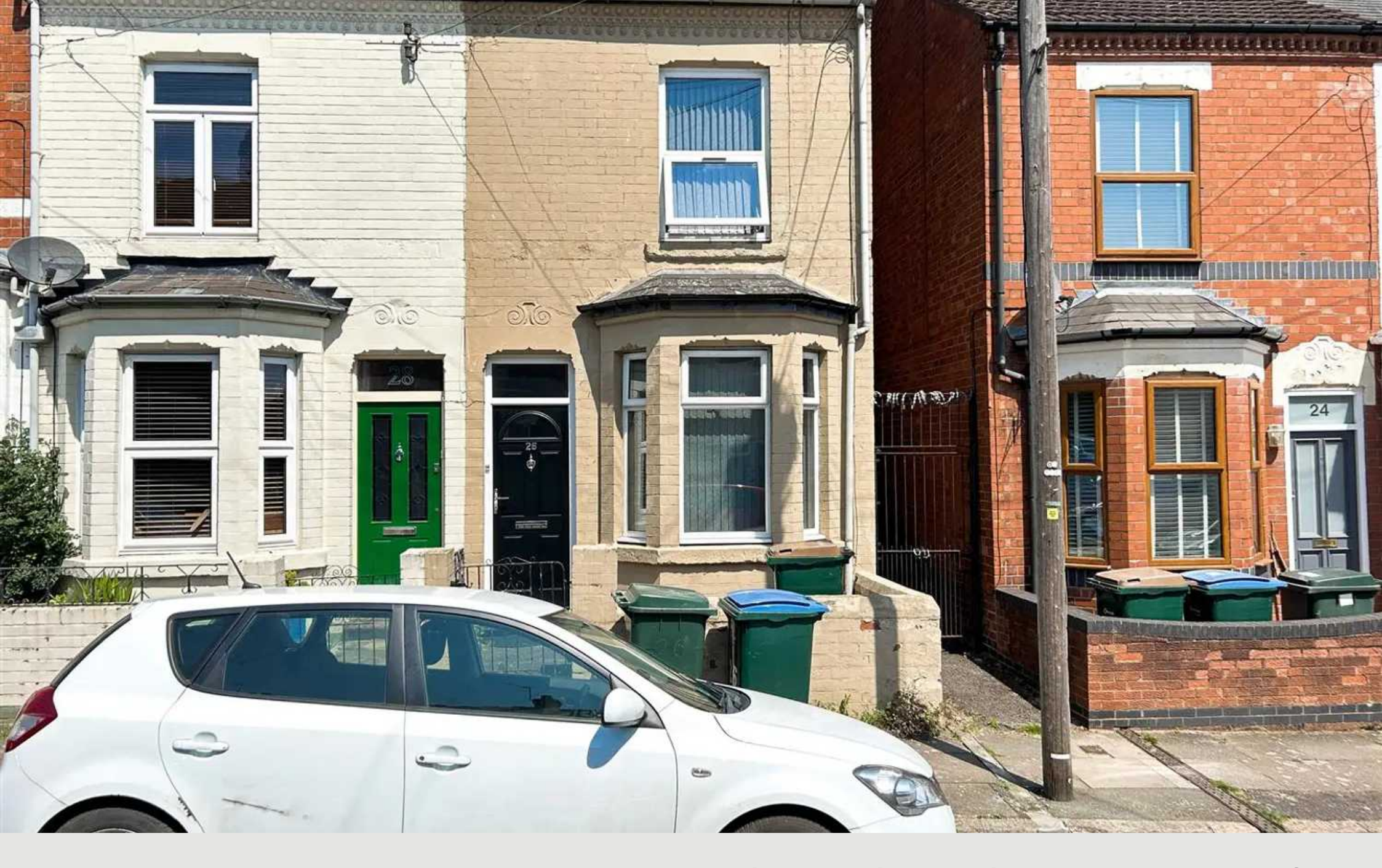
Newcombe Road, Earlsdon, Coventry CV5 6NN