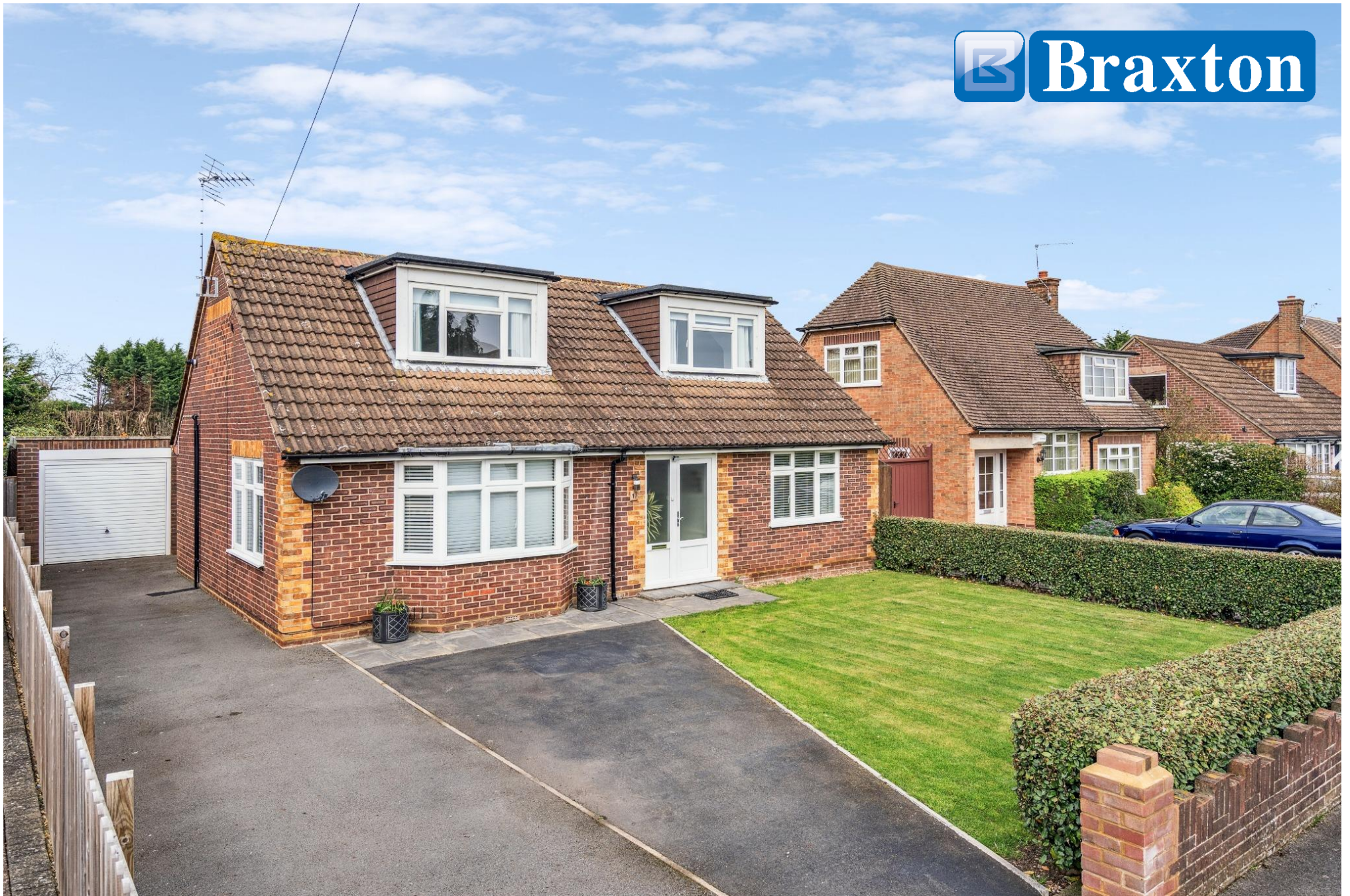
17 Hendons Way, Holyport, Maidenhead, Berkshire, SL6 2LF