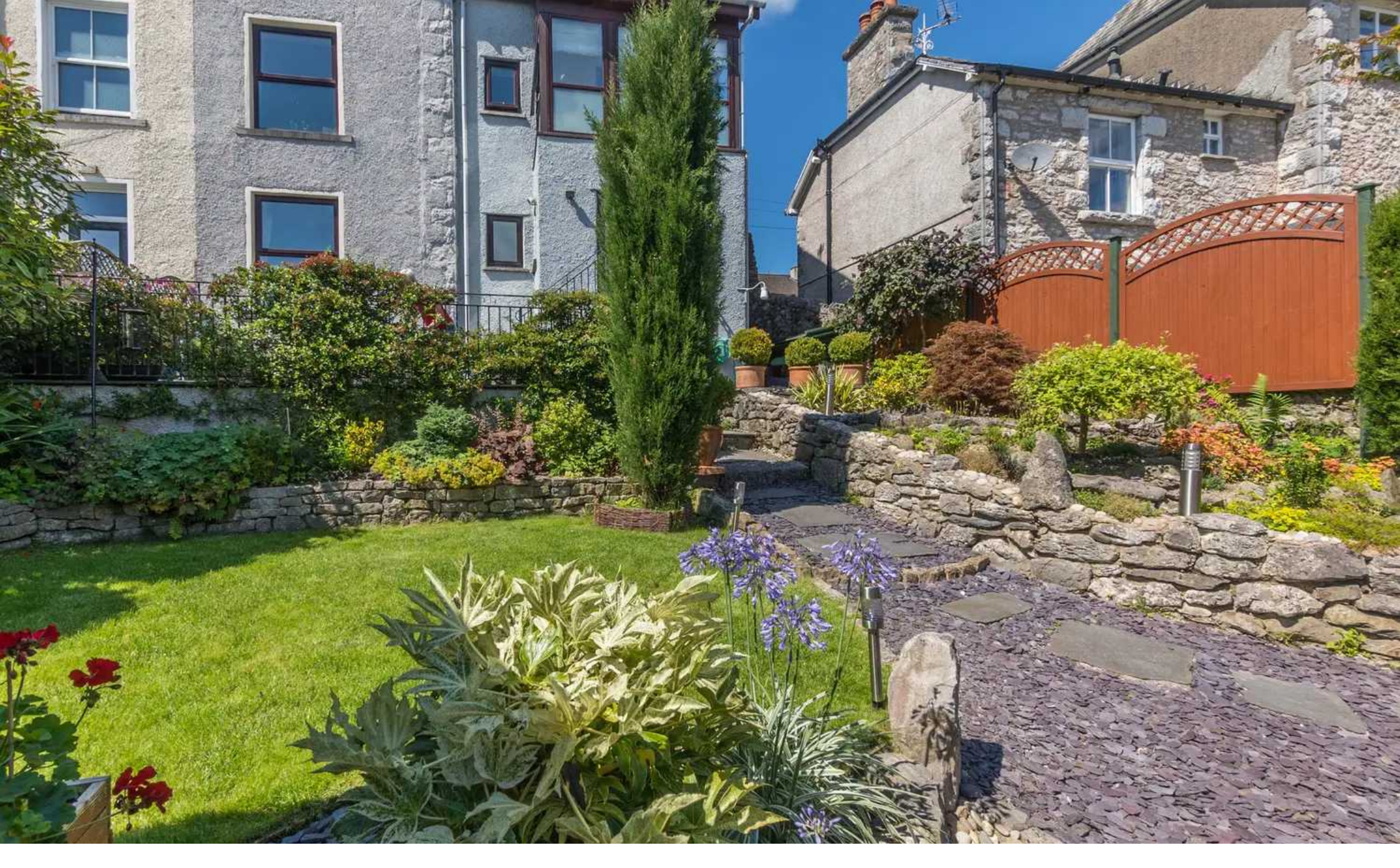
Plumtree Bank Fernleigh Road, Grange-Over-Sands £400,000 Freehold