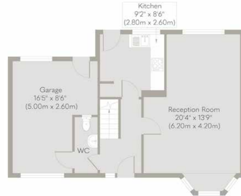
Ground Floor Approximate Floor Area 627 sq. ft (58.24 sq. m)

Whilst every attempt has been made to ensure the accuracy of the floor plan contained here, measurements of doors, windows, rooms and any other items are approximate and no responsibility is taken for any error, omission, or mis-statement. This plan is for illustrative purposes only and should be used as such by any prospective purchaser or tenant. The services, systems and appliances shown have not been tested and no guarantee as to their operability or efficiency can be given.