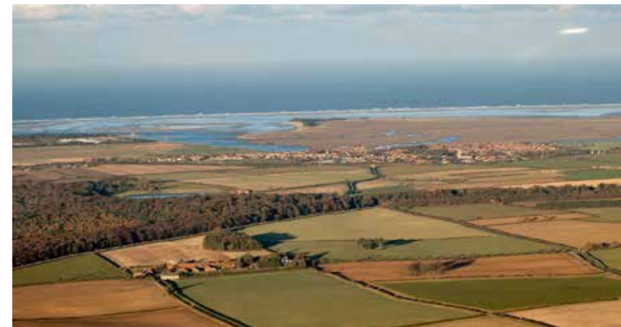
Drone shot above Holkham.

“We ‘ve always loved the Staithe but Burnham Market and Holkham Hall are firm family favourites.”