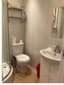
Flat 2, 58 Highfield Avenue, London, NW11 9JD Apartment Area: 228 sq.ft. (21.4 sq.m.) No. of Bedrooms: 1