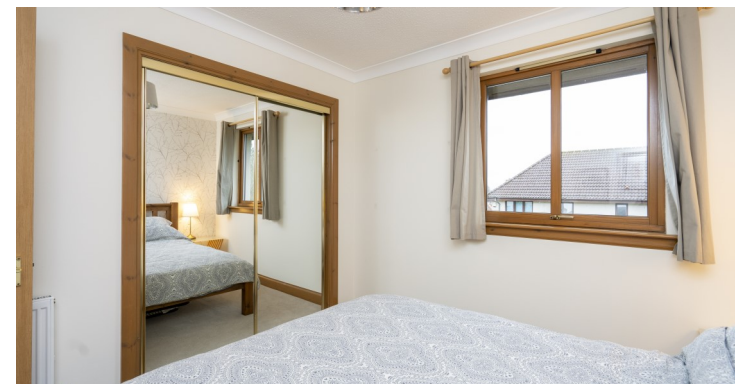
11 Silverbirch Glade