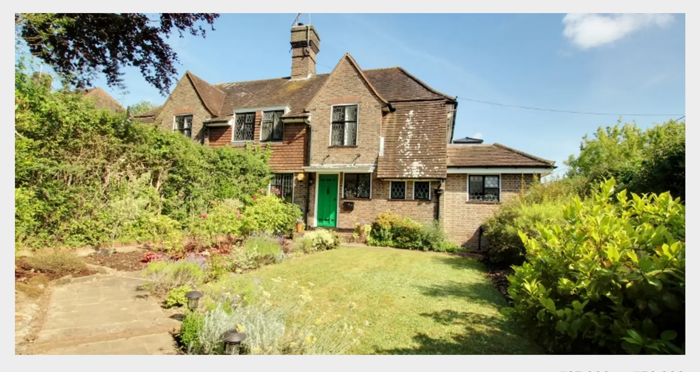
14 Gander Hill, Haywards Heath, West Sussex RH16 1QX FREEHOLD