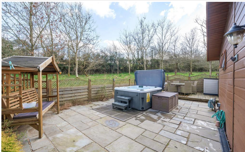
Rear Patio Area and Hot Tub