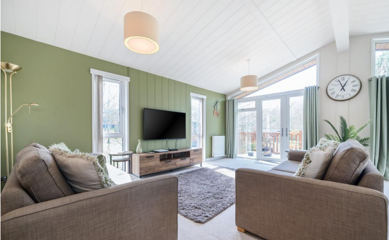
Open Plan Living/Dining Area