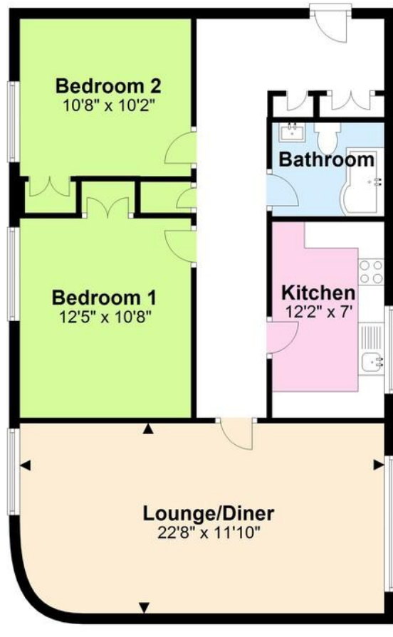
Total area: approx. 841.8 sq. feet

For illustrative purposes only. Not to scale. Plan produced using PlanUp.