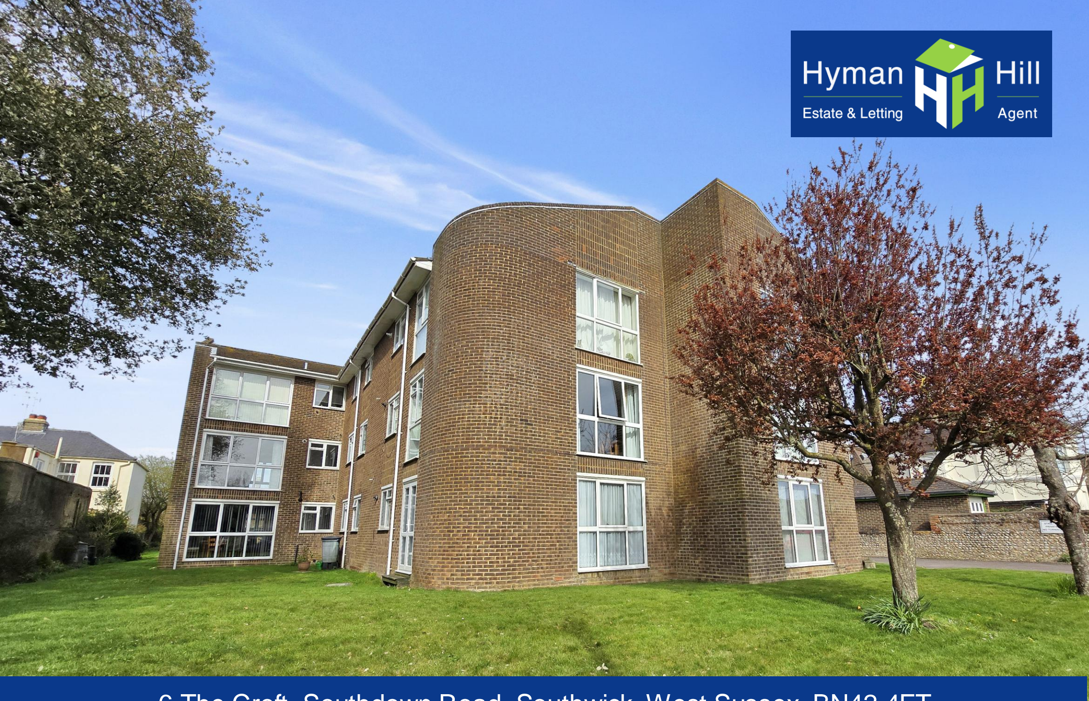
6 The Croft, Southdown Road, Southwick, West Sussex, BN42 4FT