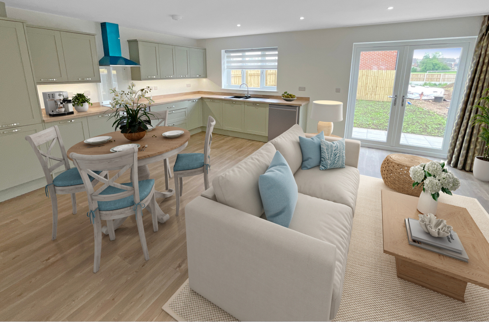
This property has been virtually staged