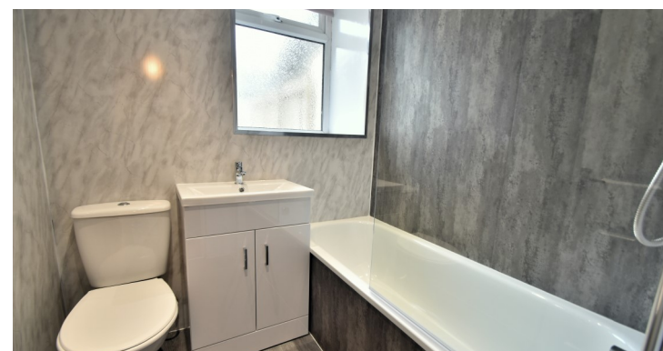
31 Main Street