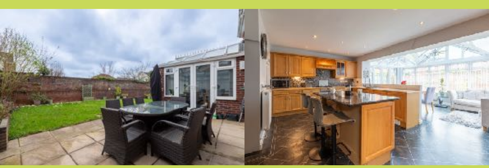
Offers in the region of £650,000

Five bedrooms I Stunning kitchen/Family/Dining room I Large lounge I Sunny gardens I Three bathrooms & Downstairs WC I Double drive I Integrated garage I Gardens to front and rear Extended Executive property in Parc Rhydlafar | Family room and playroom | Two en suite bathrooms Gas central heating & Double Glazing | VIEWING IS A MUST