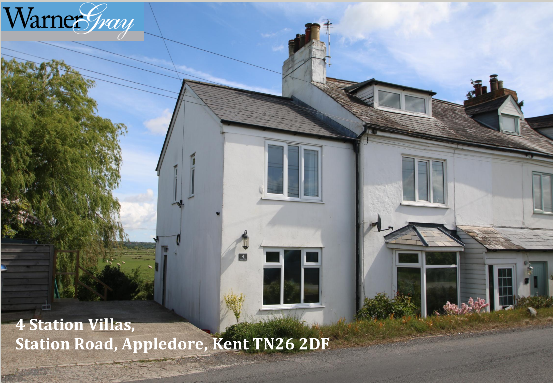
4 Station Villas, Station Road, Appledore, Kent TN26 2DF