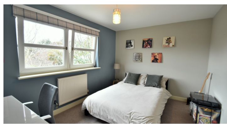
10 East Craigs Rigg